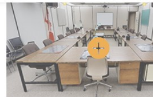
Machine Room – Narrated